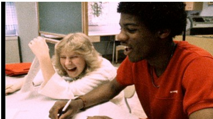
A scene from the 1982 documentary "Seventeen," which plays in PFA's "Screenagers" series.

Jul 13, 2007 The San Francisco Silent Film Festival, since 1992, has presented the best restorations and revivals of silent film